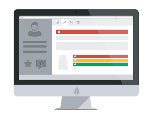
INFORMATION HANDLING Industry recognised information handling e.g. Traffic Light Protocol, to control sharing