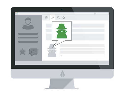
ANONYMITY Allows for Anonymous, but trusted, contributions

"One of the UK's leading cyber security companies"