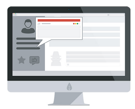
INCIDENT REPORTING Quick and efficient sharing through structured data